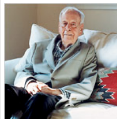
His Kind of Town