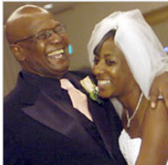
Weddings & Celebrations